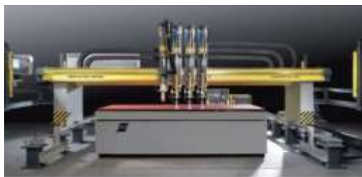
CNC Plasma Cutting System