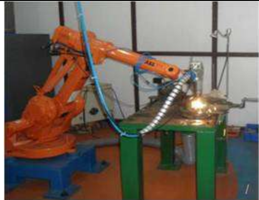
Robotic LASER processing set up