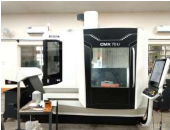
5-Axis CNC Universal Milling Machine