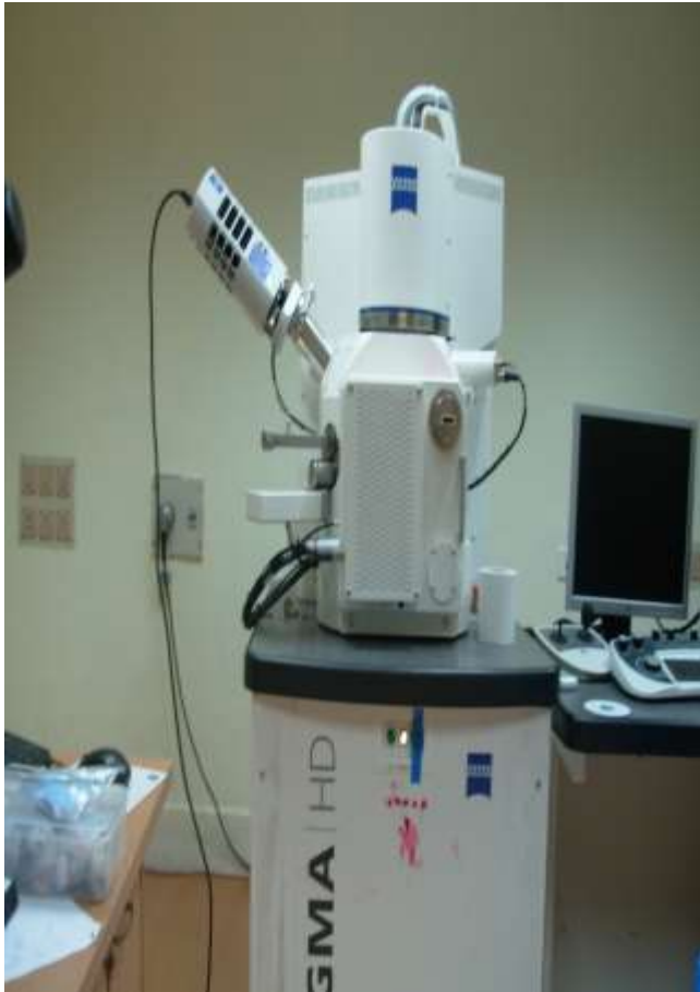
FESEM with EDS & Straining stage