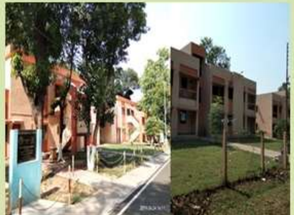
Academic Hall of Residence