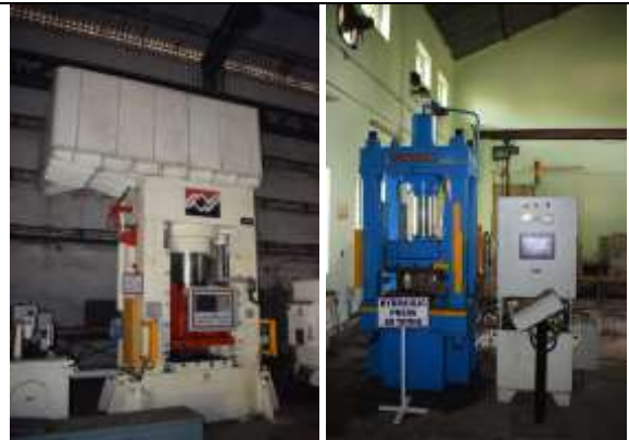
Hydraulic CNC & Conventional Press