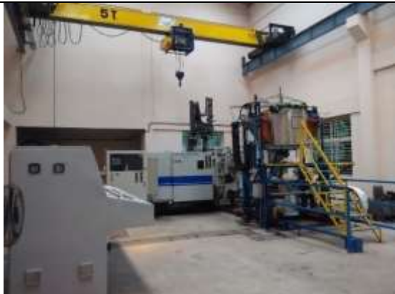
Rheo Pressure Die Casting Facility