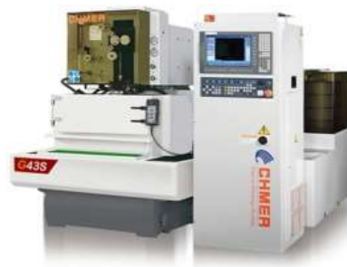
High Precision CNC Wire EDM -Submerged