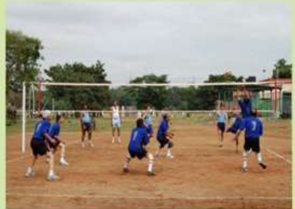
Volleyball Ground adjacent to the Academic Hall of Residence