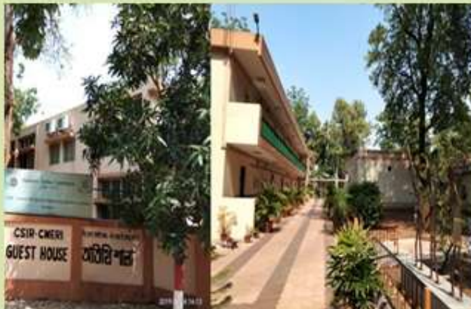
CMERI Guest House