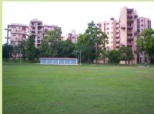
Residential Complex & Football Ground

The CMERI Staff Club is a meeting place for all members of the CMERI family. Be it the pursuit of recreation, or of an urge to take part in cultural activities, or simply for keeping fit through proper exercises, the Club premises serve as a desired destination. The Club houses two properly maintained badminton courts, has a Multigym facility, a Table Tennis board, and a horde of indoor games such as Carom, Cards, Chess, etc. The Club also has Library with a moderate holding. Adjacent to the Club Auditorium complex reposes a volleyball ground. Two fields are available at two corners of the Colony for outdoor games like football and cricket.