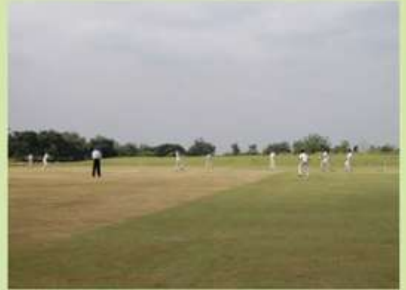
Cricket Field adjacent to the Academic Hall of Residence

Accommodation for visiting scientists, guests and other stakeholders of research and development is provided in the Main Guest House and in the Executive Hostels in the Residential Campus.