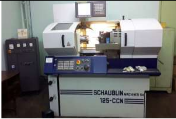
High Precision CNC Turn-Mill