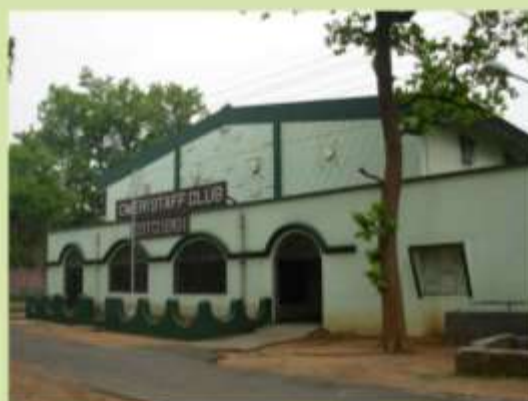
CMERI Staff Club Auditorium with indoor badminton courts