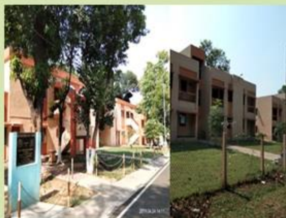
Academic Hall of Residence