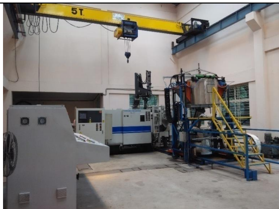
Rheo Pressure Die Casting Facility