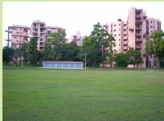
Residential Complex & Football Ground

The CMERI Staff Club is a meeting place for all members of the CMERI family. Be it the pursuit of recreation, or of an urge to take part in cultural activities, or simply for keeping fit through proper exercises, the Club premises serve as a desired destination. The Club houses two properly maintained badminton courts, has a Multigym facility, a Table Tennis board, and a horde of indoor games such as Carom, Cards, Chess, etc. The Club also has Library with a moderate holding. Adjacent to the Club Auditorium complex reposes a volleyball ground. Two fields are available at two corners of the Colony for outdoor games like football and cricket.