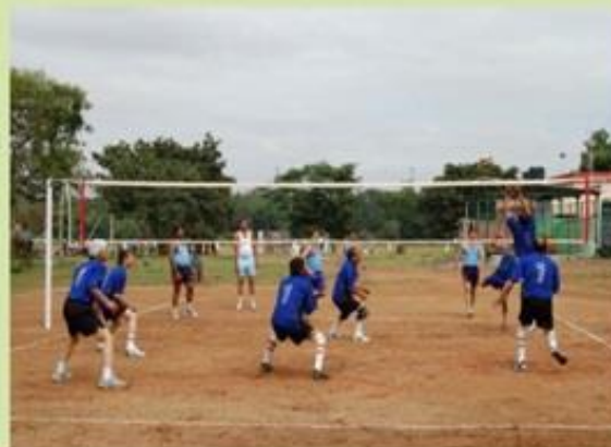
Volleyball Ground adjacent to the Academic Hall of Residence