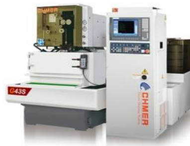
High Precision CNC Wire EDM -Submerged