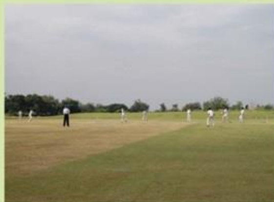
Cricket Field adjacent to the Academic Hall of Residence

Accommodation for visiting scientists, guests and other stakeholders of research and development is provided in the Main Guest House and in the Executive Hostels in the Residential Campus.