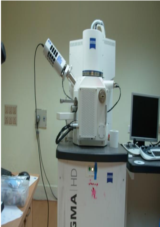
FESEM with EDS & Straining stage