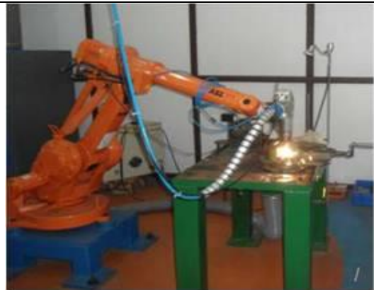
Robotic LASER processing set up