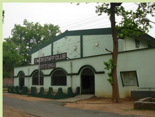
CMERI Staff Club Auditorium with indoor badminton courts