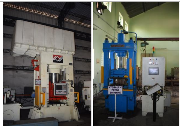
Hydraulic CNC & Conventional Press