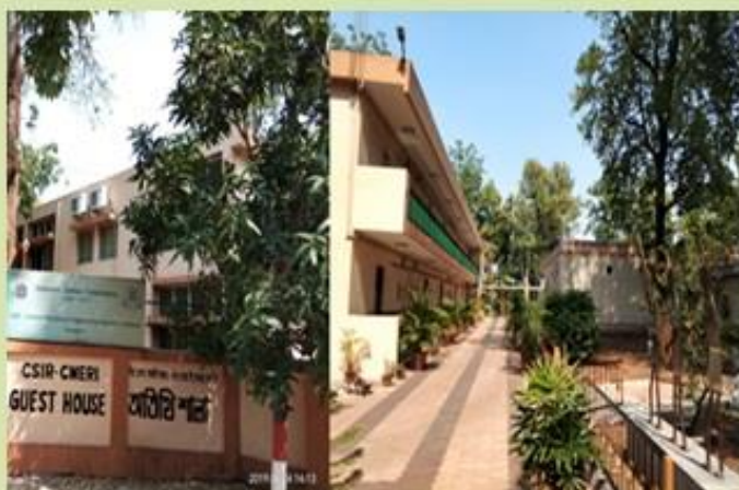
CMERI Guest House