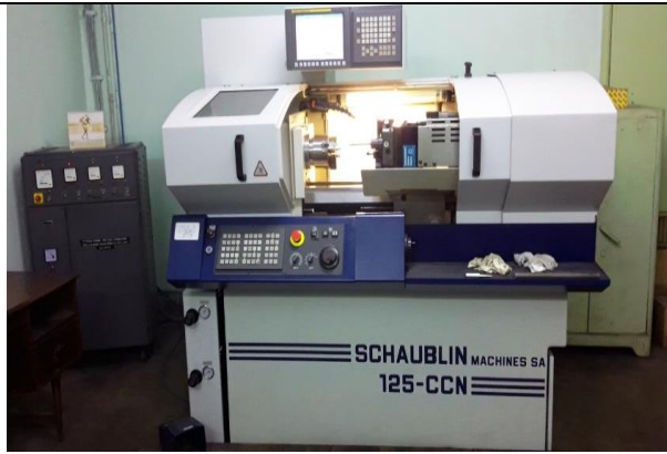
High Precision CNC Turn-Mill