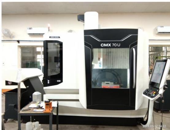
5-Axis CNC Universal Milling Machine