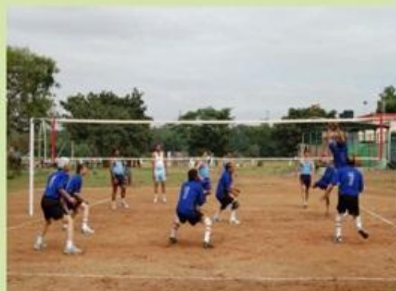
Volleyball Ground adjacent to the Academic Hall of Residence