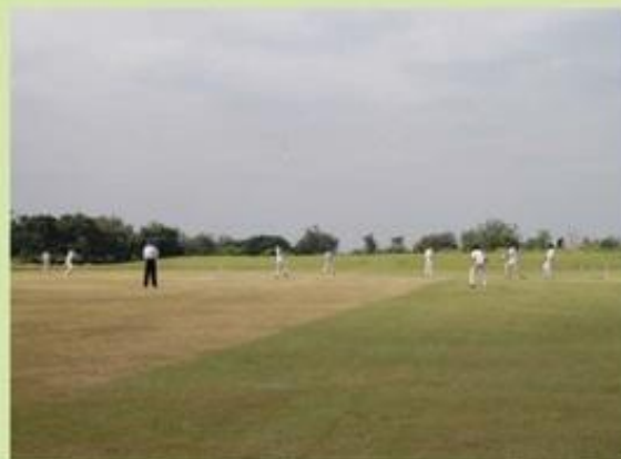
Cricket Field adjacent to the Academic Hall of Residence

Accommodation for visiting scientists, guests and other stakeholders of research and development is provided in the Main Guest House and in the Executive Hostels in the Residential Campus.