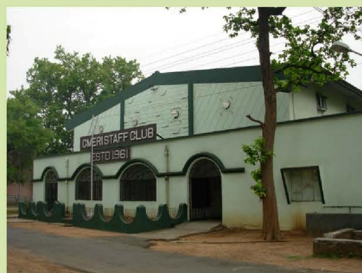
CMERI Staff Club Auditorium with indoor badminton courts