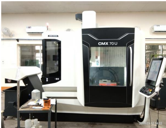
5-Axis CNC Universal Milling Machine