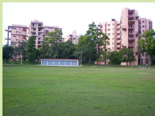
Residential Complex & Football Ground

The CMERI Staff Club is a meeting place for all members of the CMERI family. Be it the pursuit of recreation, or of an urge to take part in cultural activities, or simply for keeping fit through proper exercises, the Club premises serve as a desired destination. The Club houses two properly maintained badminton courts, has a Multigym facility, a Table Tennis board, and a horde of indoor games such as Carom, Cards, Chess, etc. The Club also has Library with a moderate holding. Adjacent to the Club Auditorium complex reposes a volleyball ground. Two fields are available at two corners of the Colony for outdoor games like football and cricket.