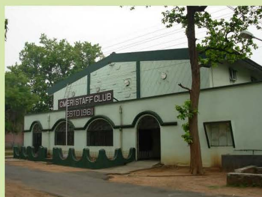
CMERI Staff Club Auditorium with indoor badminton courts