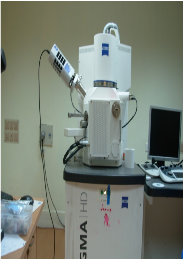
FESEM with EDS & Straining stage