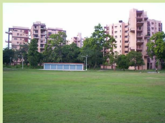
Residential Complex & Football Ground

The CMERI Staff Club is a meeting place for all members of the CMERI family. Be it the pursuit of recreation, or of an urge to take part in cultural activities, or simply for keeping fit through proper exercises, the Club premises serve as a desired destination. The Club houses two properly maintained badminton courts, has a Multigym facility, a Table Tennis board, and a horde of indoor games such as Carom, Cards, Chess, etc. The Club also has Library with a moderate holding. Adjacent to the Club Auditorium complex reposes a volleyball ground. Two fields are available at two corners of the Colony for outdoor games like football and cricket.