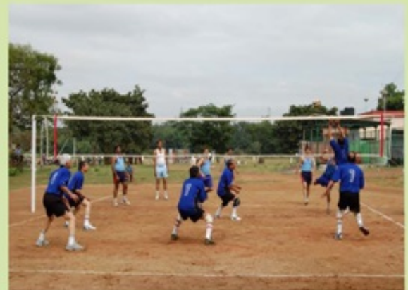
Volleyball Ground adjacent to the Academic Hall of Residence