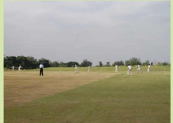
Cricket Field adjacent to the Academic Hall of Residence

Accommodation for visiting scientists, guests and other stakeholders of research and development is provided in the Main Guest House and in the Executive Hostels in the Residential Campus.