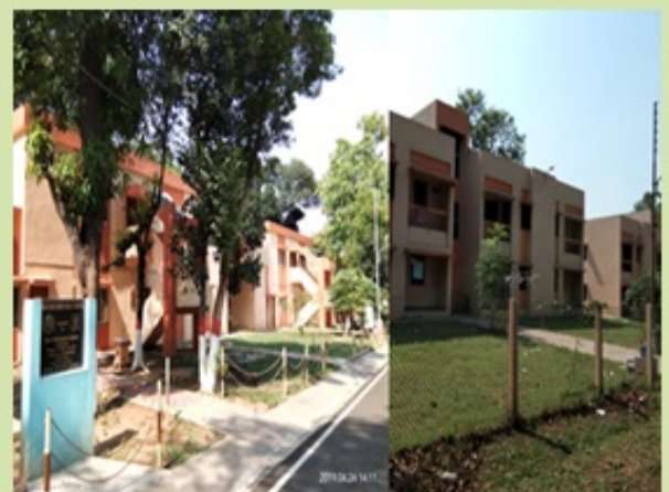
Academic Hall of Residence