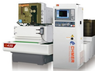
High Precision CNC Wire EDM -Submerged