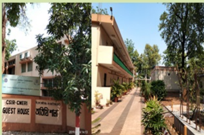
CMERI Guest House