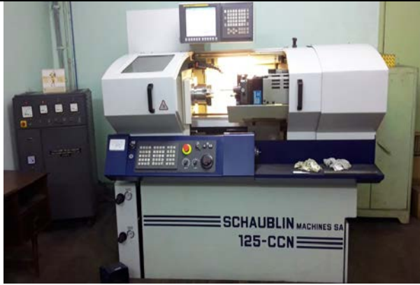
High Precision CNC Turn-Mill