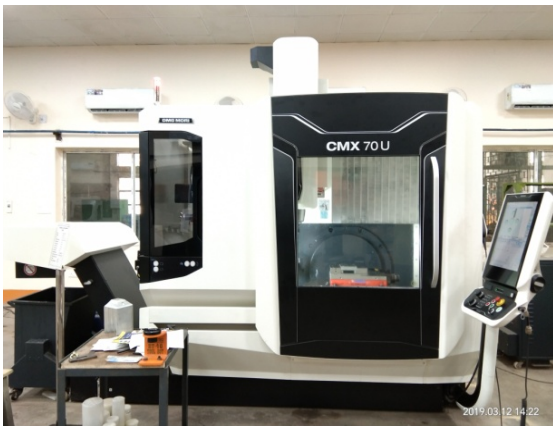
5-Axis CNC Universal Milling Machine